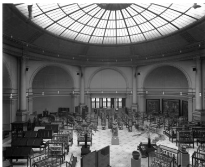
The Octagon (Loan) Court, 1920, V&A Archive, MA/32/410, negative 49410

By 1924, the growth of the Museum's collections was such that the merits of reserving an area as large as the Octagon Court for temporary loans was questioned (archive ref. MA/47/1/1). It was not until 1933, however, that the 'Moot of Senior Officers' decided to assign the space to the Furniture Department and loans were no longer displayed together but absorbed within the appropriate departmental permanent exhibits (MA/47/1/2); this decision was subsequently presented to the Advisory Council for further consideration at its 25 January 1934 meeting (MA/49/1/3).