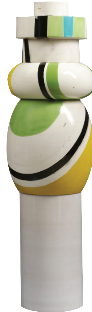
Totem by Ettore Sottsass. Purchase funded by the Friends of the V&A