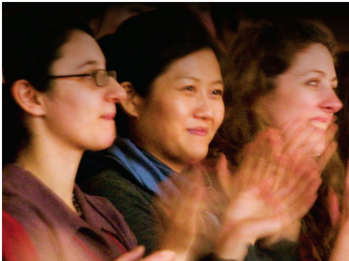
The inaugural Members' Week was a great success, and led to a second which ran from 14 – 20 May 2011

their support and encourage them to try different Members' activities, and also that it would show non-Members what they were missing and encourage them to join. The inaugural Members' Week was a great success, and led to a second which ran from 14 – 20 May 2011.