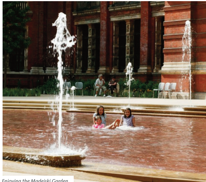
Enjoying the Madejski Garden

overseeing the objectives set out above. In order to inform Trustees of their responsibilities, Trustees are circulated with the Charity Commission booklet 'Responsibilities of Trustees CC3' and a Trustees' Handbook prepared by the Membership Office. In view of the size of the trust and its resources, the Trustees are wary of devoting funds to expensive training programmes, but keep the need for trustee training under review and respond to any particular request that a trustee may have in this regard. The Committee is composed of a minimum of four members and four ex-officio members from the Museum: the Director of the V&A (or representative), the Director of Public Affairs (or representative), the Director of Collections, and the Director of Development, plus the Head of Friends and Patrons (Company Secretary).