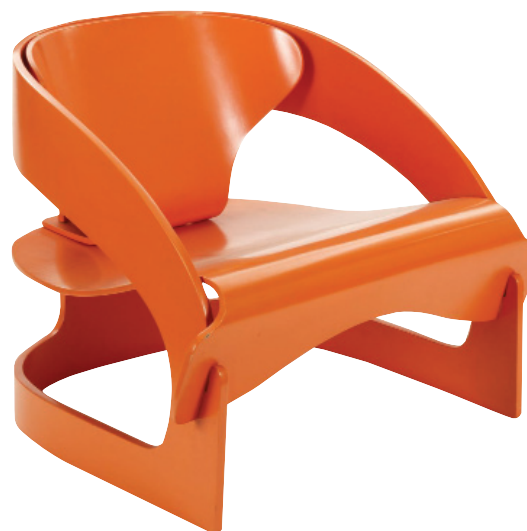
Joe Cesare Colombo, Model 4801, 1963 From the Members’ Week event Creating the Furniture Galleries