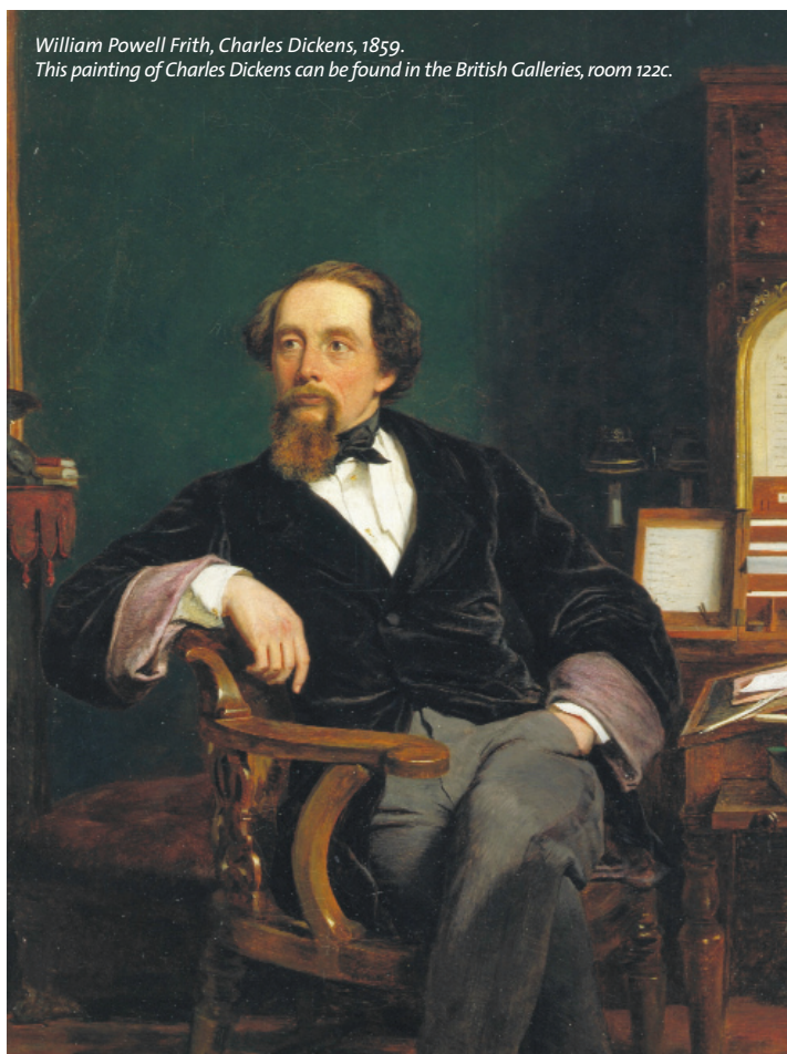
William Powell Frith, Charles Dickens, 1859. This painting of Charles Dickens can be found in the British Galleries, room 122c.