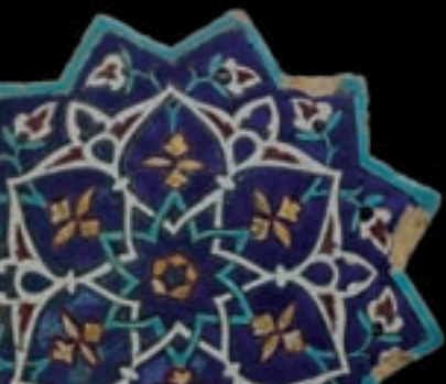
Earthenware tile Iran, c.1444