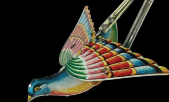
Mechanical toy birds China, late 20th century

By examining specific objects and production practices, the student is able to focus on historical and contemporary issues previously ignored or obscured. The specialism fosters empirical investigations and interpretations through first-hand study, while at the same time addressing larger issues about how design is integral to the production and circulation of meaning. In defining their own research subjects in the period, students on the MA course can develop an interest in a particular geographical and chronological area, or develop cross-cultural expertise in the history of Asian design.