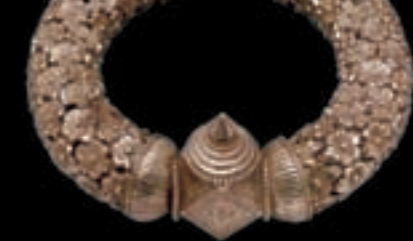
Florets anklet Maharashtra, India, c.1900

An intensive week-long study visit, held during the first year of the course, focuses on a single city or region as a centre for design, production and material culture, and takes the group behind the scenes in museums, archives and workshops.