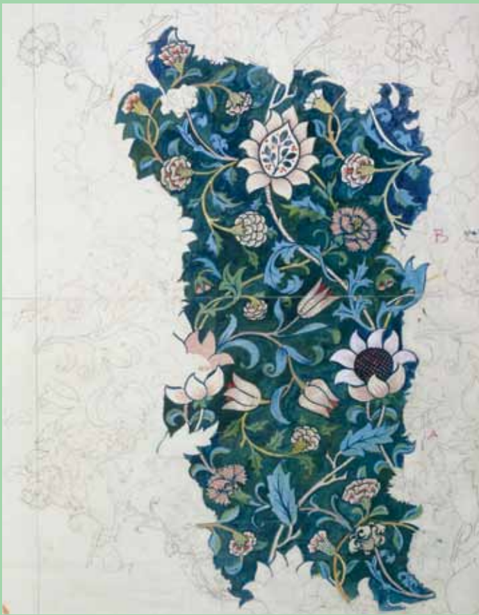
Partially finished design for wallpaper – Evenlode , designed by William Morris, late 19th century