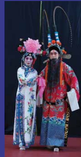
Chinese opera scene.

Seminar Room 1 14.30, 15.00, 15.30 & 16.00 Duration 30 minutes Try your hand at Chinese music making and discover over 30 traditional instruments including strings, woodwind, brass and percussion. Free, timed tickets available 15 minutes before each session