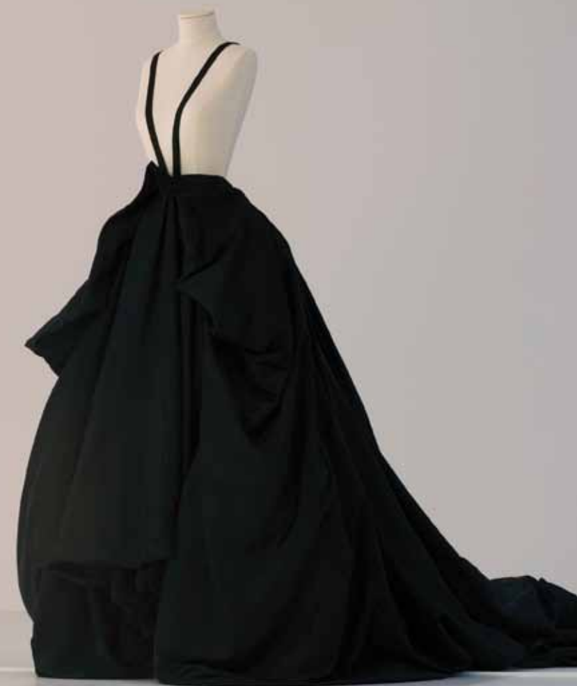
Evening dress in black silk, Autumn/Winter 1995-96, Juste des Vêtements exhibition, Musée de la Mode et du Textile, Paris 2005

£7 in person at the V&A. Concessions available. V&A Members go free. *